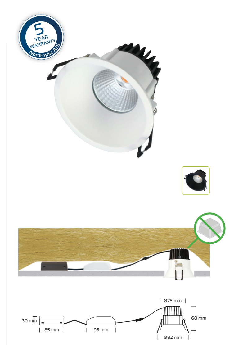
*The drawing is not drawn to scale