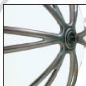
cervinia cod. 9006SEN pag. 184-185