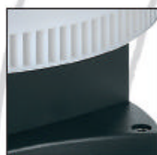
luna cod. 440SEN 440.040P1SEN 440K040P1SEN 440.090P1SEN 440K090P1SEN 440.040P2SEN 440K040P2SEN 440.090P2SEN 440K090P2SEN