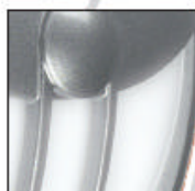
cervinia cod. 9006SEN pag. 182-183