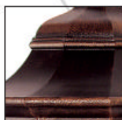
maiorca cod. 421BSEN