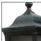
rio cod. 425SEN 425ASEN