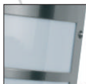
acqua cod. 9100SEN 9100KSEN 9103SEN