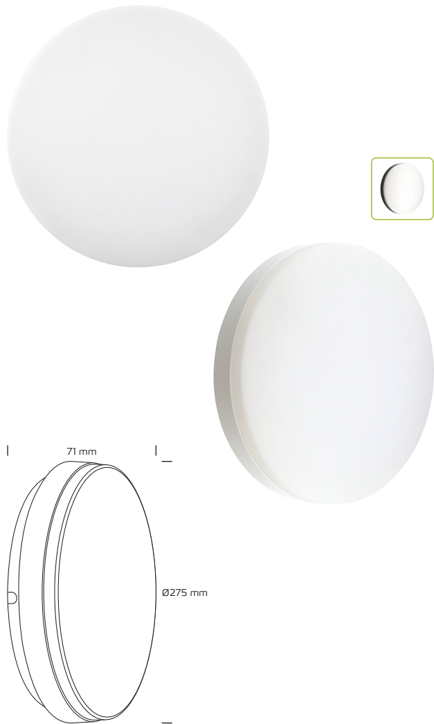
*The drawing is not drawn to scale