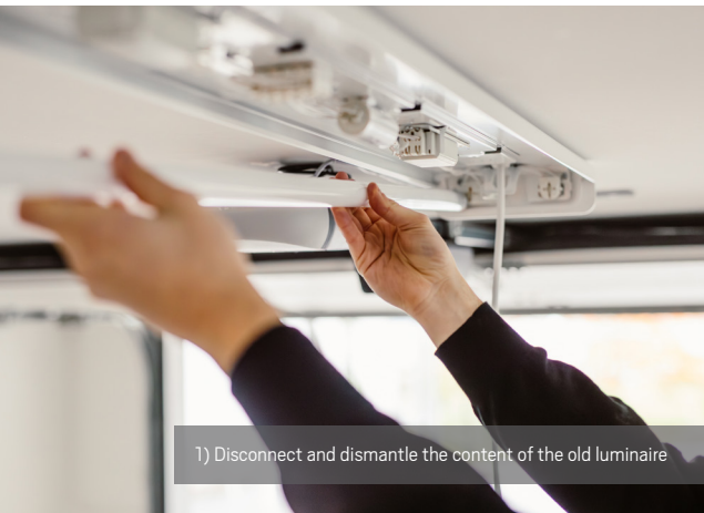
1) Disconnect and dismantle the content of the old luminaire