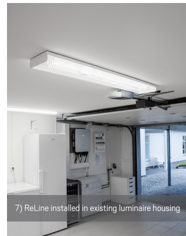
7) ReLine installed in existing luminaire housing