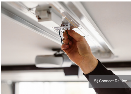
5) Connect ReLine