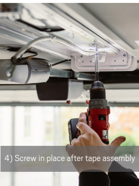
4) Screw in place after tape assembly