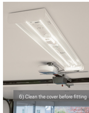
6) Clean the cover before fitting